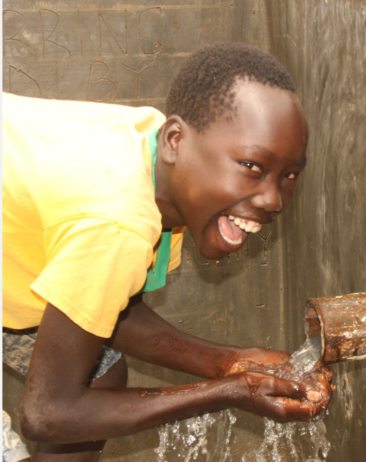
Image: Child drinking at a new safe water project in Uganda.

In Uganda, two contaminated groundwater sources were protected, providing clean, safe water to over 900 people living in three villages.