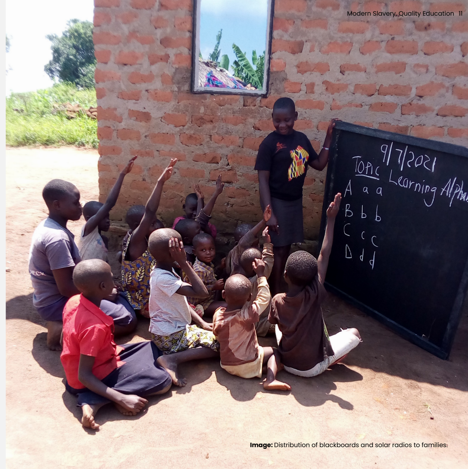
Image: Distribution of blackboards and solar radios to families.

Children at the Chafisi school and orphanage in Kenya returned to school after long pandemic lockdowns.