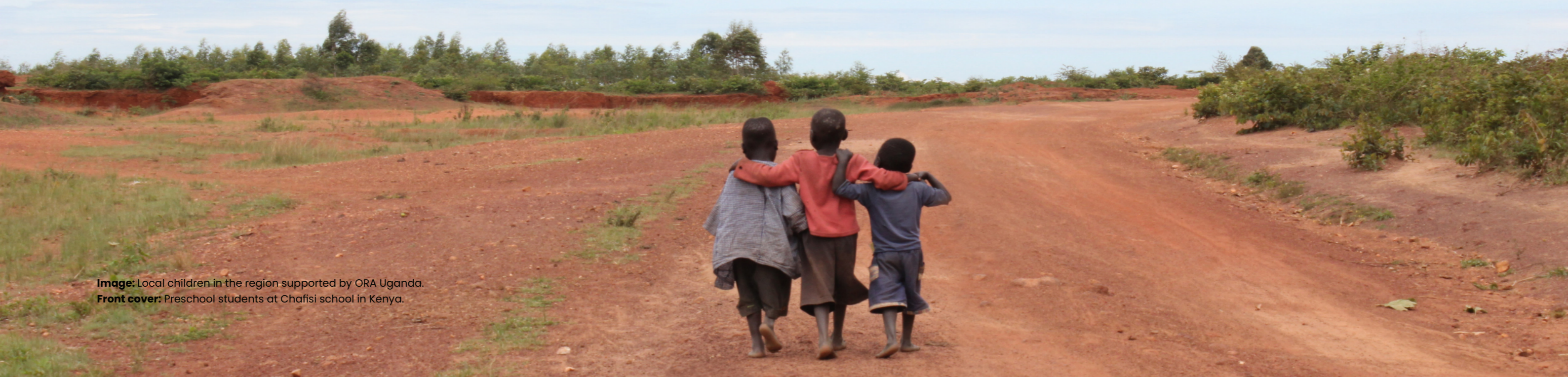
Image: Local children in the region supported by ORA Uganda.